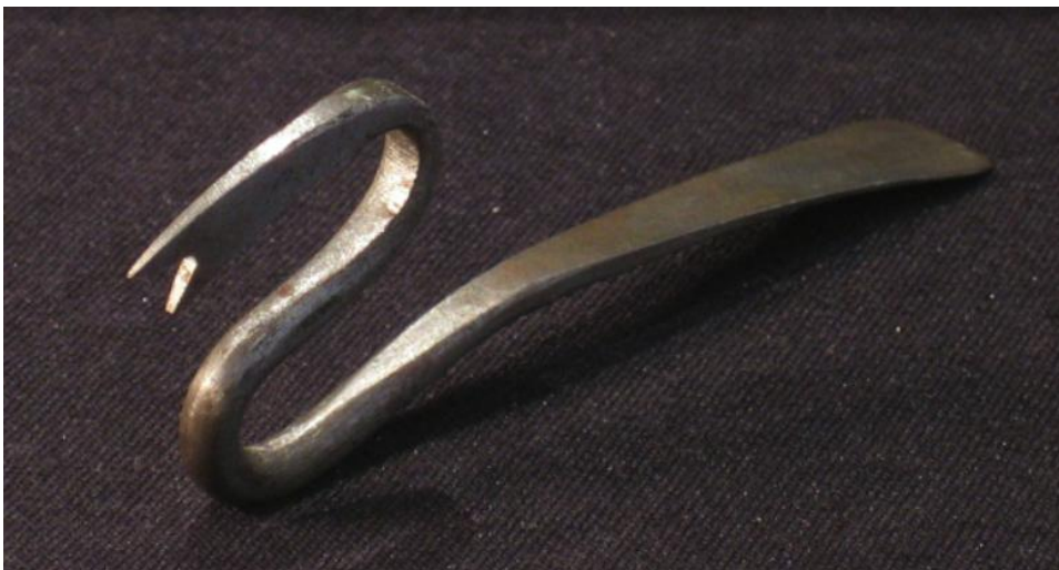
Fishy Tool VI (1977)