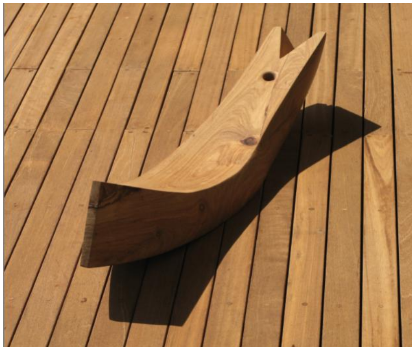
Blind Fish I (2007)