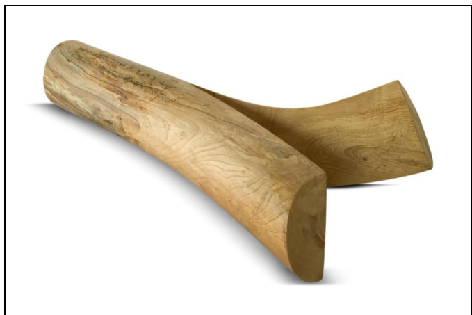
Blind Fish VI (2011)