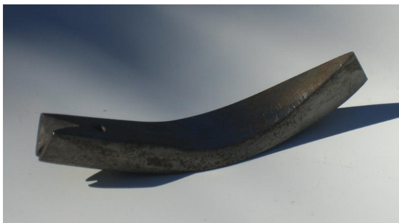
Fishy Tool I (1977)