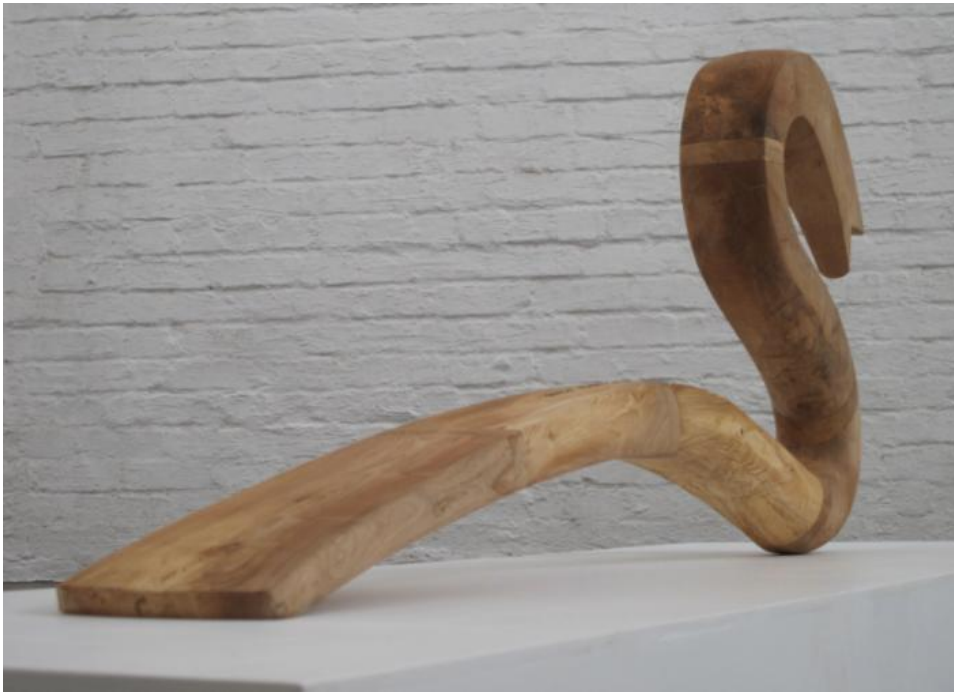
Blind Fish VIII (2011)