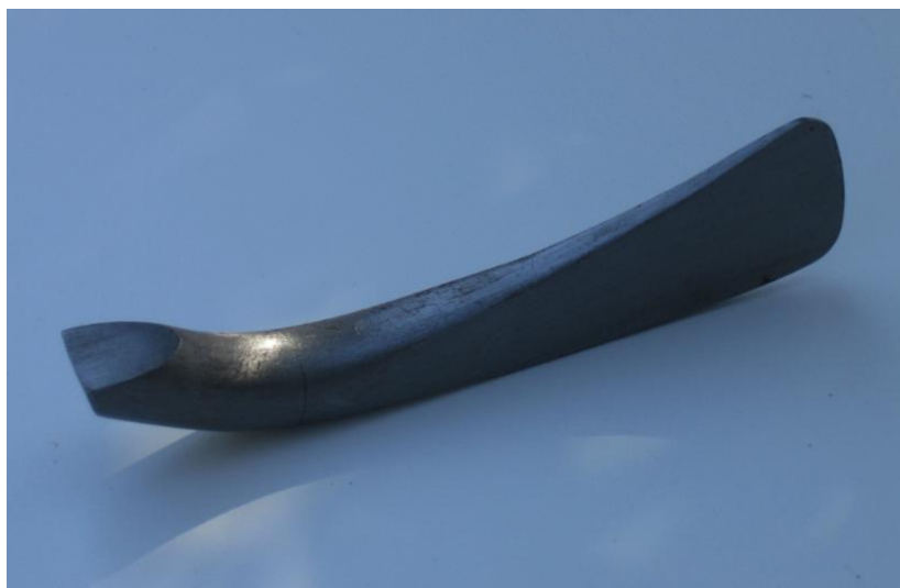
Fishy Tool II (1977)