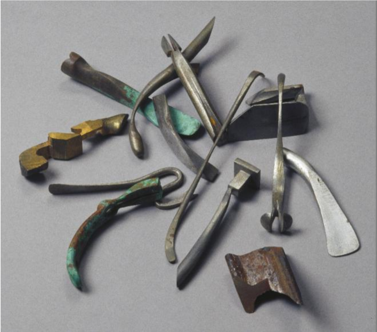
The thirteen original Fishy Tools (1977)