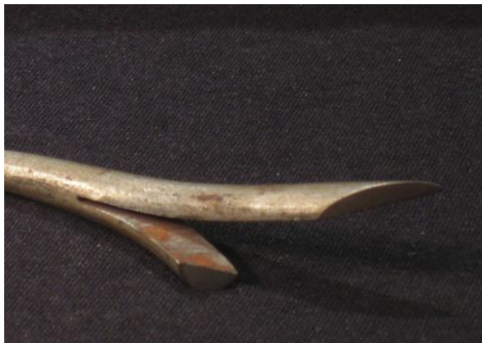
The section of Fishy Tool IV used as reference for Blind Fish VI