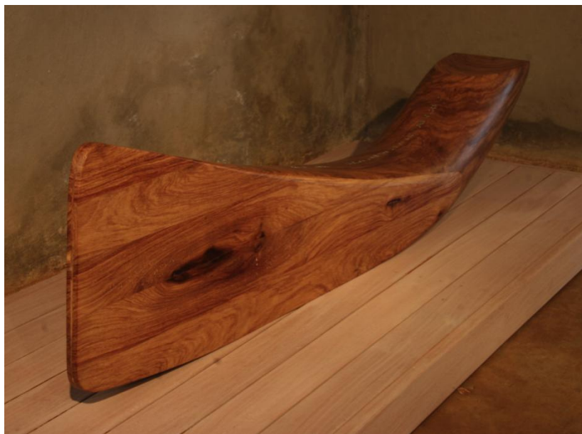
Blind Fish II (2007)