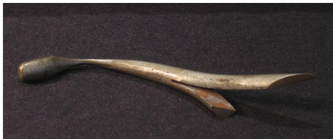
Fishy Tool IV (1977)